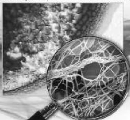
Actual patient blood slide before initial use of Neprinol. Colored scanning electron micrograph. Actual image magnified several times.

Unhealthy Blood (patient has severe arthritis and rheumatoid)