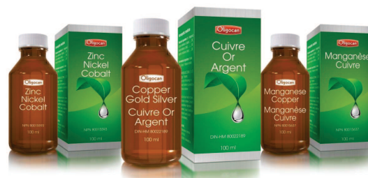
OLIGOCAN LINE BY HOMEOCAN